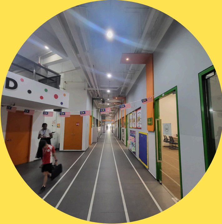
KS1: Little Explorers' Lane