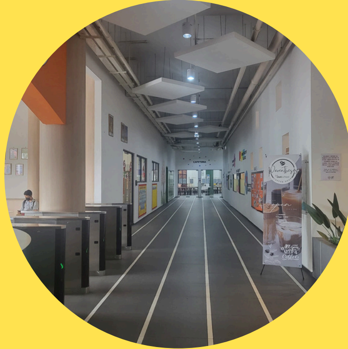
EY: First Steps Street